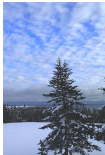
Winter from Rockefeller Hall