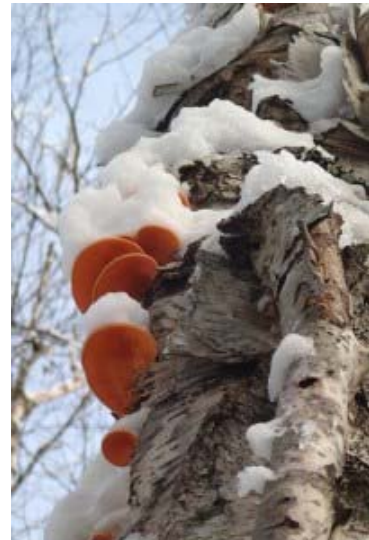
Snow and fungi on birch