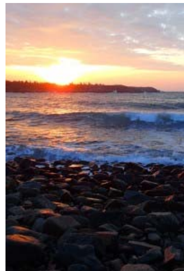
Sunrise over Little Moose Island from Schoodic Point

Join us February 25th at 6:30 pm for this free workshop, limited to 20 participants age 16 and up. Pre-registration strongly encouraged.